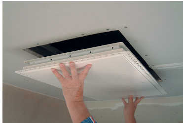
2: Offer the panel to the hole