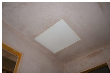
7: Ceiling second coat and polish