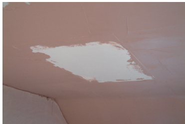
6: Finished first coat