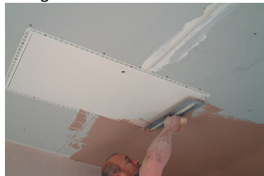
5: Skim over the beaded frame