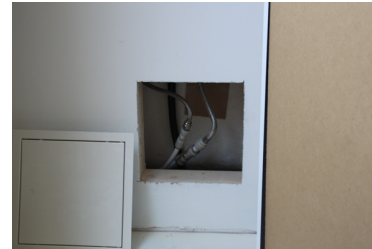
1: Prepare the hole in the wall or ceiling

Picture Frame Access Panels are the perfect access solution in situations where your walls and/or ceilings have already been finished. They create a neat and tidy access point with very little fitting effort.