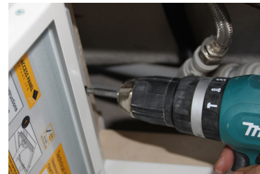
5: Hold the panel in place and use the pre-punched fixing holes on the side of the frame to secure