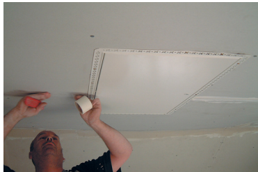
4: Tape the ceiling