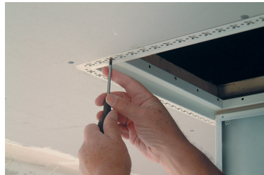
3: Use the pre-punched side and flange fixing holes