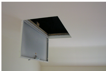
8: Clean out the plaster from between the door and the frame before emulsifying over ceiling and door face.