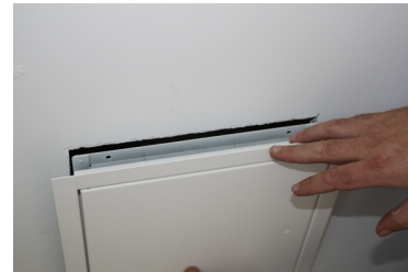
3: Take care to ensure the panel fits into the hole