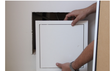
2: Offer the panel to the hole