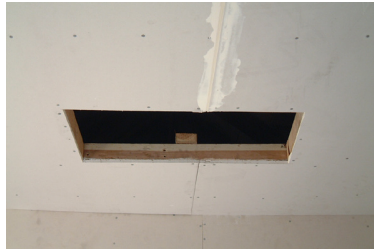
1: Cut the plasterboard to the aperture

Beaded Frame Access Panels require an unfinished wall or ceiling for installation. By plastering the panel in to the wall or ceiling an elegant, clean look is achieved with the aperture.